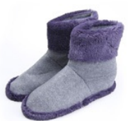
USB ( )